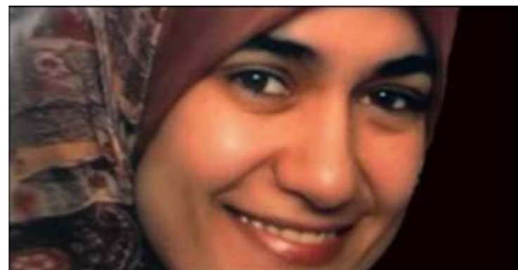
Dr. Marwa El Sherbini