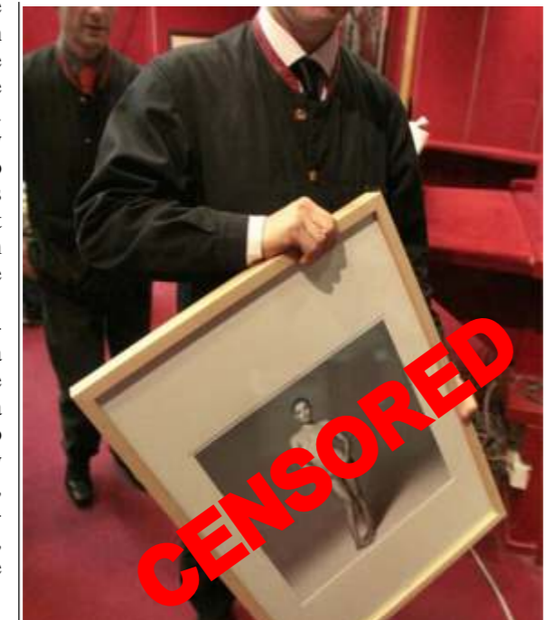
The Naked Picture of Nicholas Sarkozy's wife

(http://www.telegraph.co.uk/news/newstopping/celebritynews/5389986/Nude-photo-of-Carla-)