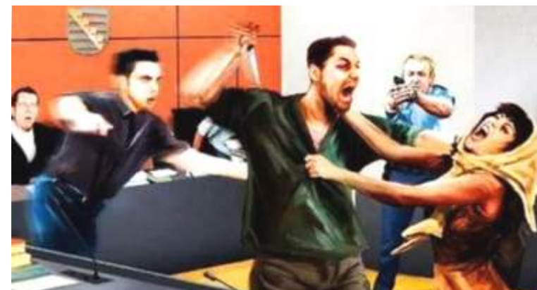
The attack in the Court

The Indian News Media was in Complete Silence Over The Issue of the Head Scarf Martyr