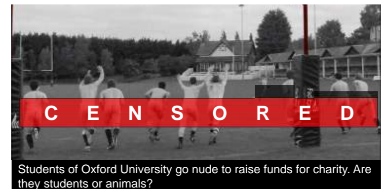
Students of Oxford University go nude to raise funds for charity. Are they students or animals?

The other pictures showed a row of cheeky chaps baring all on the famous Iffley rugby field for November, another for May showed two blonde babes getting cozy in the Christ Church halls, which had housed scholars