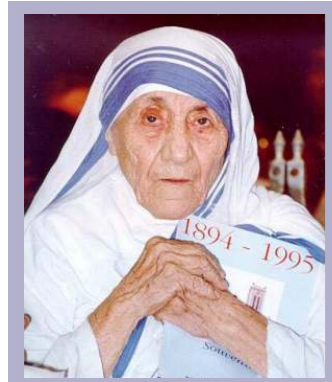
Mother Therasa dressed modestly